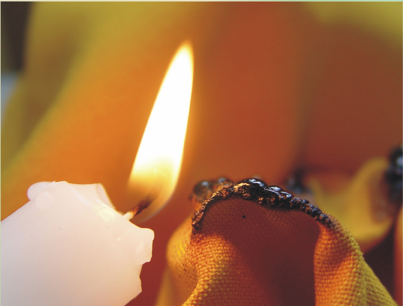
Figure 3. Wool foams rather than burns.

Wool's natural flame resist properties, the availability of alternative flame resist treatments and the ability to blend wool with flame resist fibres ensures a good future for wool in highly specified, technical and novel end products.