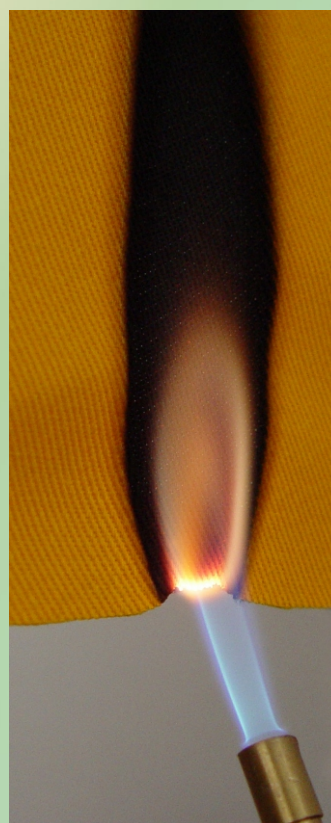
Figure 2. Wool is difficult to ignite.

Due to its natural low flammability characteristics, wool has traditionally been the fibre of choice in many technical applications, ranging from nightwear and protective garments, to transportation and specialized military requirements.